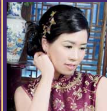
Vigor Photo Studio

Reading Group Guide prepared by Jennifer McMahon. To order, contact your Hachette Book Group sales rep or call 1-800-759-0190.